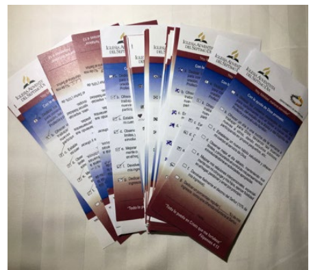
Praying for 150+ pastors from Colombia and Inter-American Division who committed themselves to the Lord during the Holy Convocation

The high point of the program comes at the end of the week when a commitment call is made to pastors, using the Promise commitment card, which also has the same 7 points of the visitation's agenda. The pastors in turn replicate this commitment ceremony in the churches where they are ministering during the week.