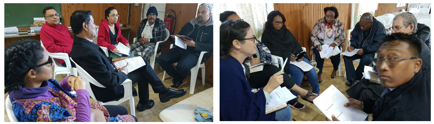
La Reunion Conference of Indian Ocean Union Conference hosted a Stewardship Ministries Retreat at Ephese from June 30 – July 2, 2017. The Theme was "Rediscovering Our Identity as Christians".