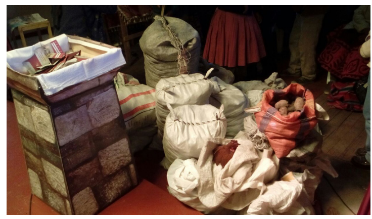
Members from the Pulpera/Velille Church, in Cusco, Perú, bringing from their crops and products, including chicken during a Tithe & Offering Festival.