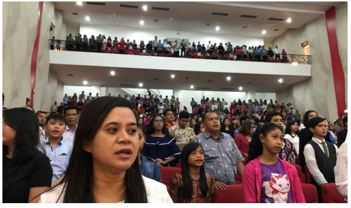
Every night more than 1,000 people attended the meeting.