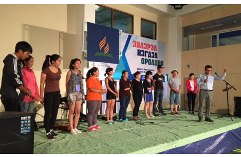
Mongolian Stewardship Congress: offering collection and baptismal candidates.