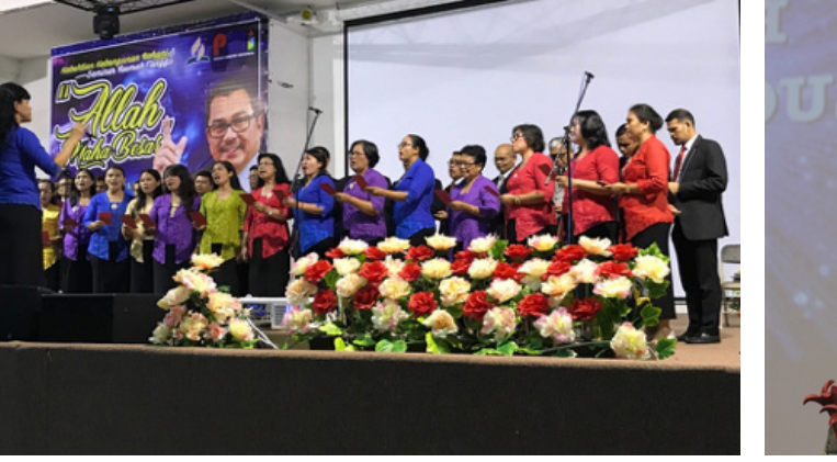
Choirs and singing groups praising God through their singing every night. What a foretaste of heaven.