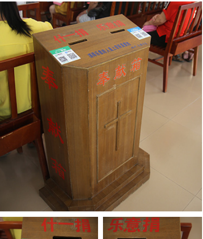
Offering box in the Longhua Seventh-day Adventist Church in Shenzhen, China: left hole for tithe and right for offering. QR code allows electronic payments.