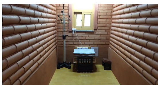
Top: A Prayer building in South Korea where Adventist workers are encouraged to spend at least one week in a special season of prayer. Bottom: A prayer cell.