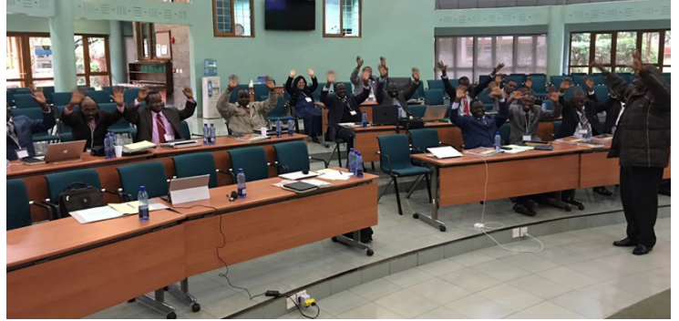
ECD Stewardship Ministries directors make the "Promise" at the end of their advisory held in Nairobi,