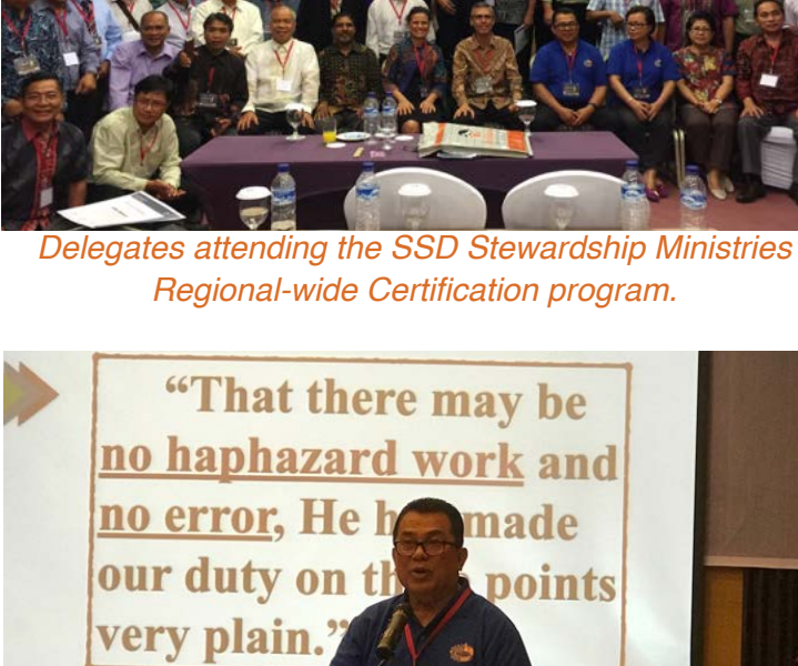
no error, He hamade